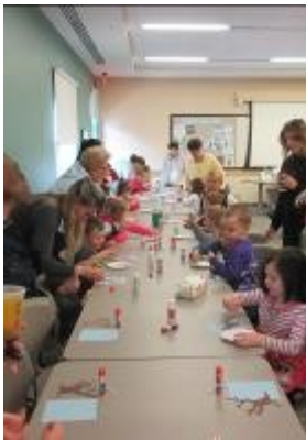
We explored robots in Innovators Club and painted spring blossoms in storytime in March!