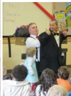
Half Twisted-Half Knot put on a great balloon magic show March 27!