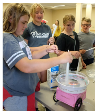
Funding for the return of Teen Late Night is just one of the ways the Friends supported the library in 2022.