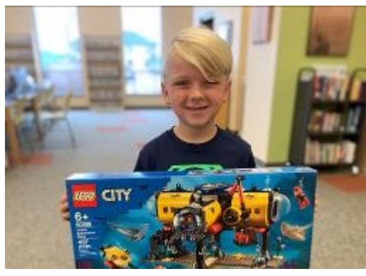
One of the lucky Summer Reading grand prize winners!

The Friends held the 13th annual golf outing fundraiser September 7 at the Lake Wisconsin Country Club. It was a beautiful day for the event. Thank you to all the golfers, sponsors, donors, diners, and volunteers that helped to make the golf outing a success. And thank you to the Lake Wisconsin Country