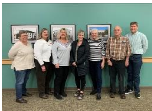
Members of the Friends of the Ruth Culver Community Library Board

And the Friends provide valuable support to the library. The capital