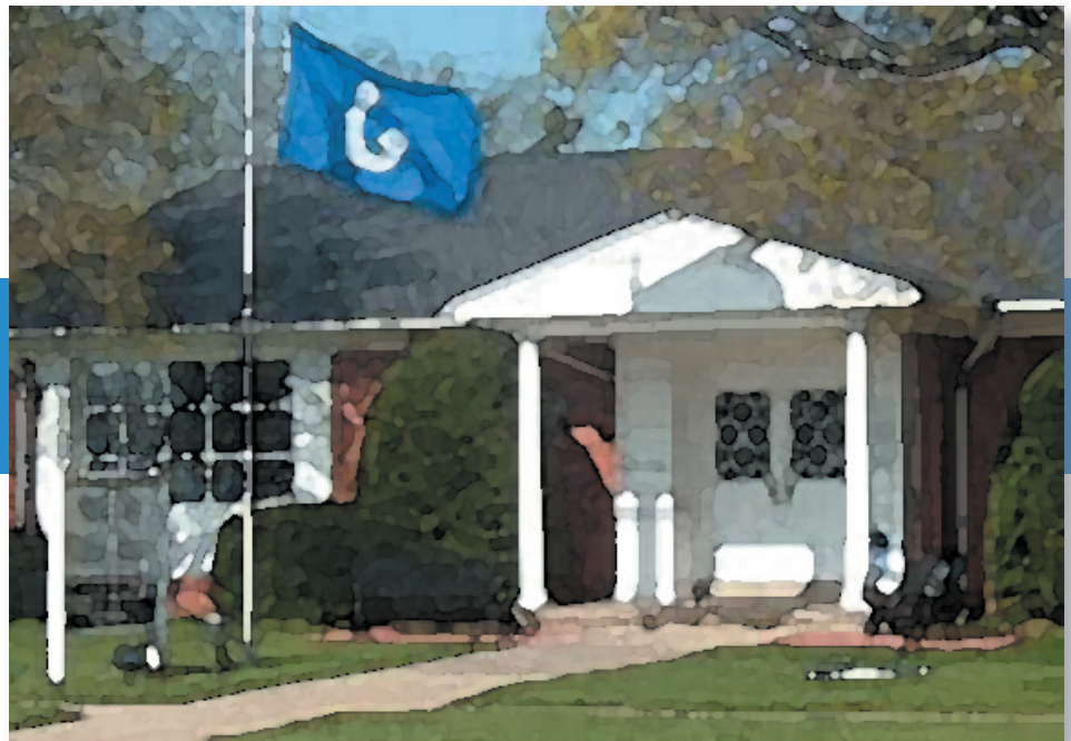
Sauk City Public Library