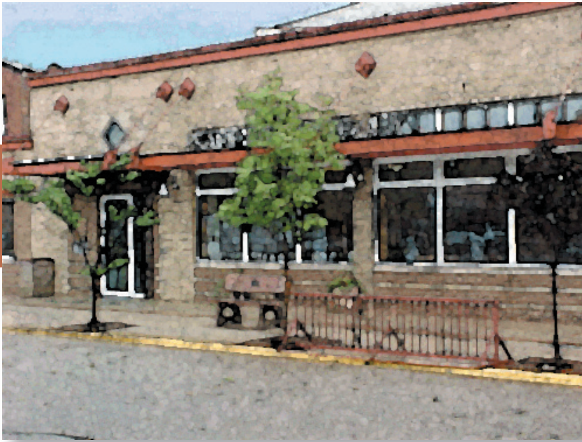
Prairie du Sac Public Library